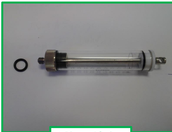
O-Ring and Syringe