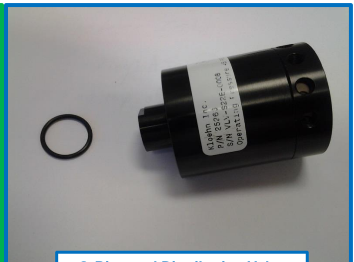
O-Ring and Distribution Valve